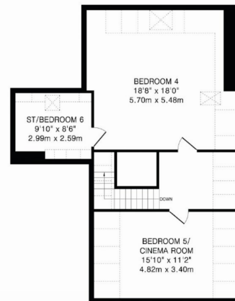
Second Floor 791 sq.ft.(73.4 sq.m)approx.

TOTAL FLOOR AREA: 3251 sq.ft.(301.8 sq.m)approx. This floorplan is for illustration purposes only. The measurements and position of each element are approximate and must be viewed as such.