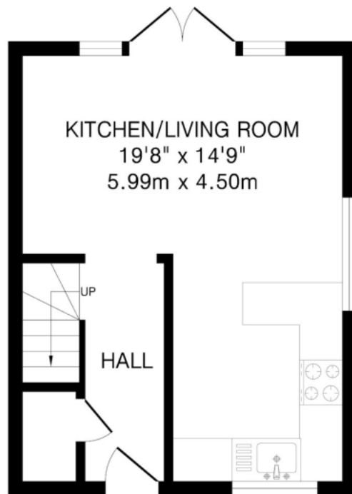
Ground Floor 290 sq.ft.(26.9 sq.m)approx.