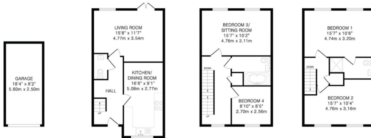
Garage 151 sq.ft.(14.0 sq.m)approx. Ground Floor 429 sq.ft.(39.8 sq.m)approx. First Floor 406 sq.ft.(37.6 sq.m)approx. Second Floor 406 sq.ft.(37.6 sq.m)approx.

TOTAL FLOOR AREA: 1392 sq.ft.(129.0 sq.m)approx.