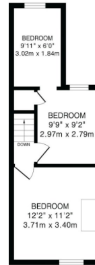
First Floor 297 sq.ft.(27.5 sq.m)approx.

TOTAL FLOOR AREA: 673 sq.ft.(62.4 sq.m)approx.