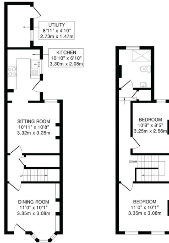
Ground Floor 426 sq.ft.(39.6 sq.m)approx. First Floor 375 sq.ft.(34.8 sq.m)approx.

TOTAL FLOOR AREA: 801 sq.ft.(74.4 sq.m)approx. This floorplan is for illustration purposes only. The measurements and position of each element are approximate and must be viewed as such.